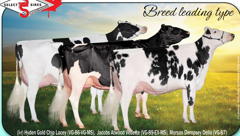
(l-r) Hyden Gold Chip Lacey (VG-86-VG-MS), Jacobs Atwood Vedette (VG-89-EX-MS), Morsan Dempsey Della (VG-87)

It's only available this fall through your Select Sires Generations sales rep.